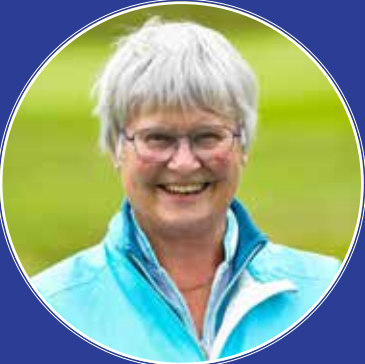
Liz Perrottet Without Portfolio