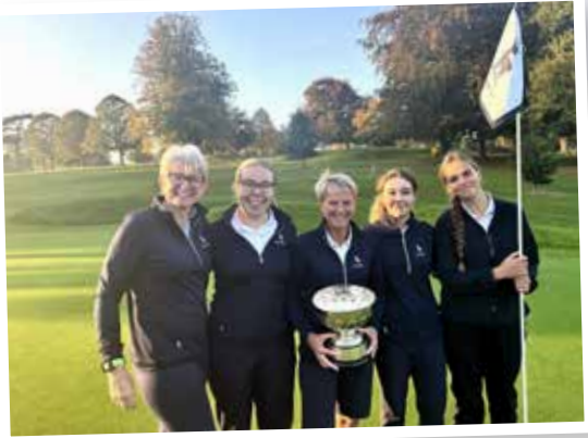
East Herts retain Women's Scratch League trophy