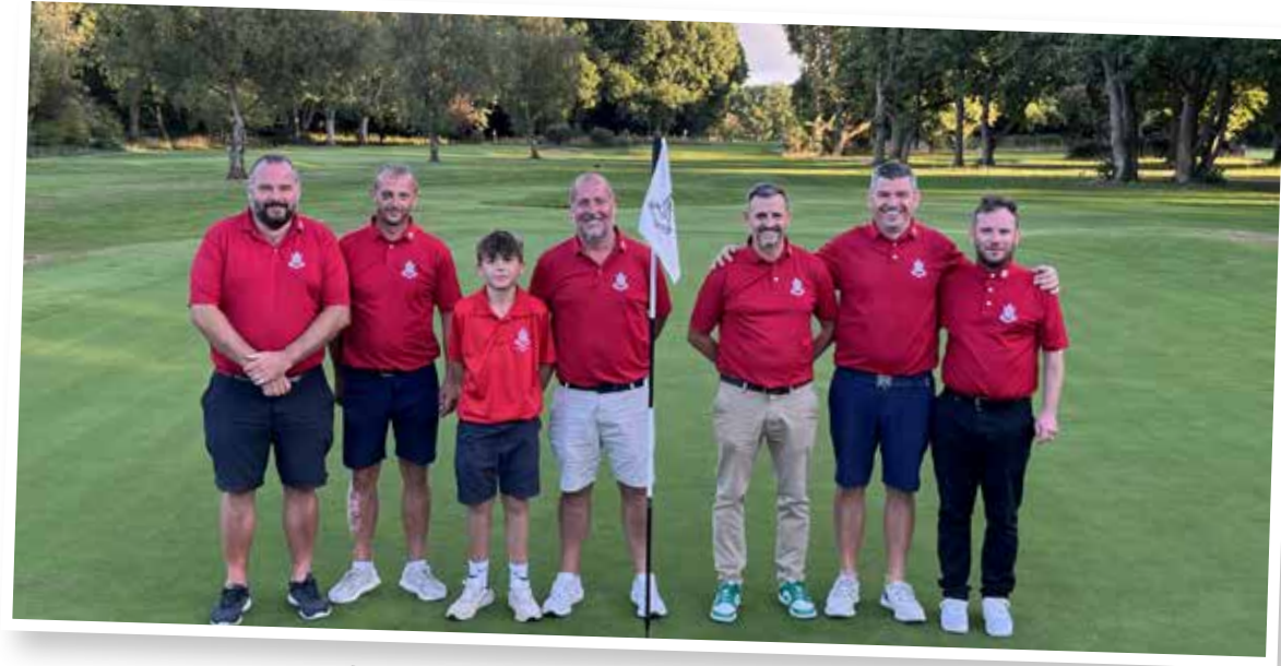
Harpenden Common - winners of Men's Scratch League

A huge thank you to Golf Holidays Direct for sponsoring the men's and women's scratch leagues.