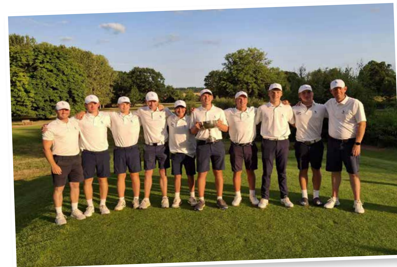
Herts Boys At South East Qualifier

Later in the year the boys came agonisingly close to the national title at Elsham Golf Club in Lincolnshire, when Cheshire pipped Hertfordshire by just half a point.