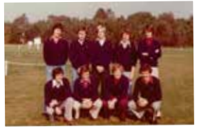
Herts Team circa 1978