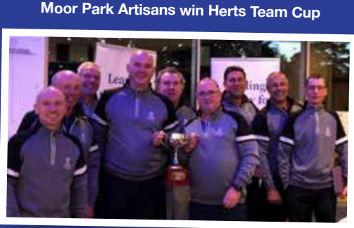
Moor Park Artisans win Herts Team Cup