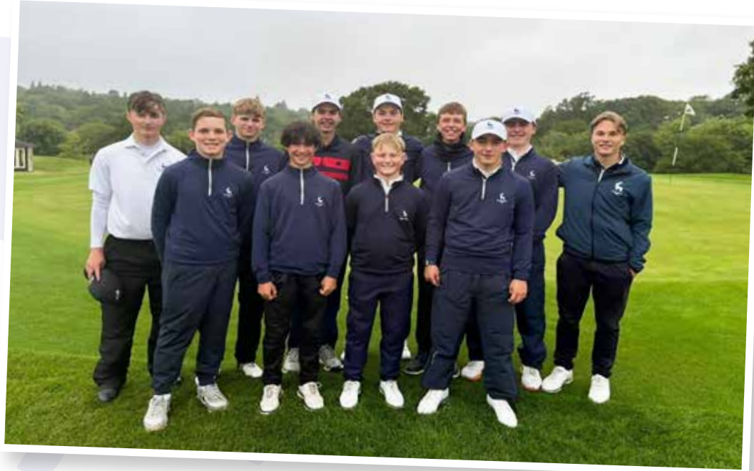
Hertfordshire Boys retain The Cheshunt Salver