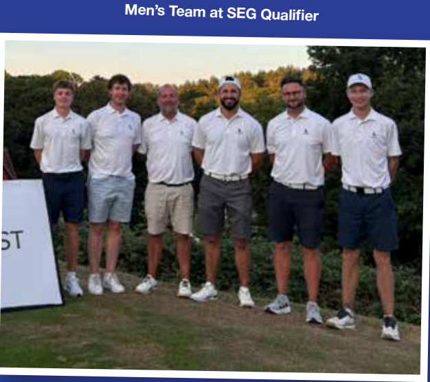
Men's Team at SEG Qualifier

Finally, a big thank you must go to everyone in the Hertfordshire Golf office. Your hard work, organisation, and support behind the scenes are deeply appreciated