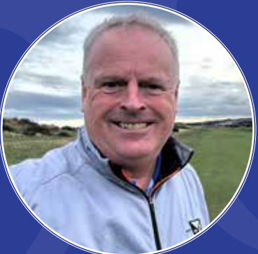
Don Ward Finance