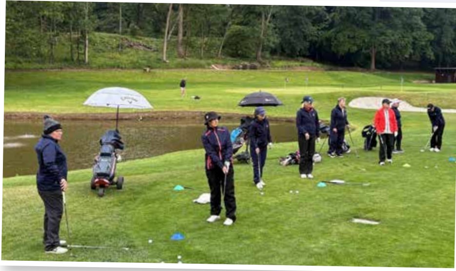
Team getting ready to face the elements