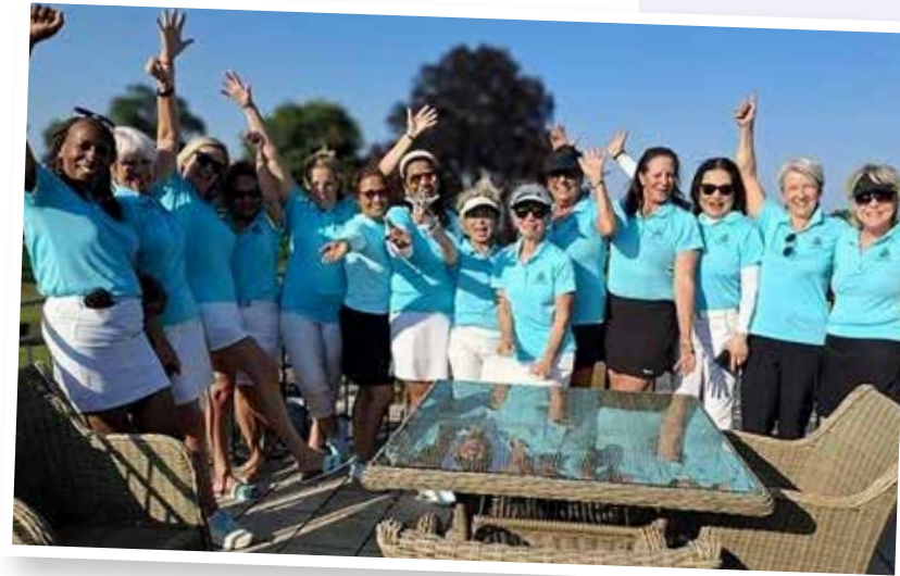
Bocket Hall Women's Team win Pearson Trophy

The Pearson Trophy finals day was hosted by East Herts Golf Club and Bocket Hall women's team triumphed. Bocket Hall beat Hadley Wood in the final after a semi-final victory over Essendon in the morning. Bocket Hall went on to represent Hertfordshire in the Inter County Finals Day but lost out to Middlesex in the semi-final.