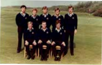
Herts 1985 English County Finals Team