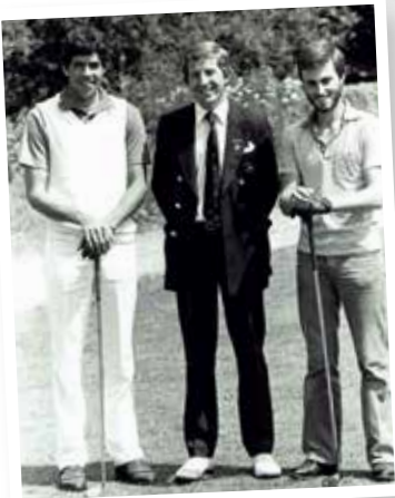
County Championship Moor Park June 1982